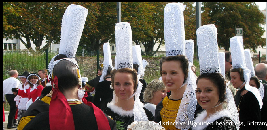
XIII from TOKYO / CC BY-SA 3.0