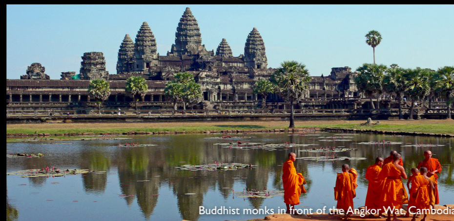
Buddhist monks in front of the Angkor Wat, Cambodia