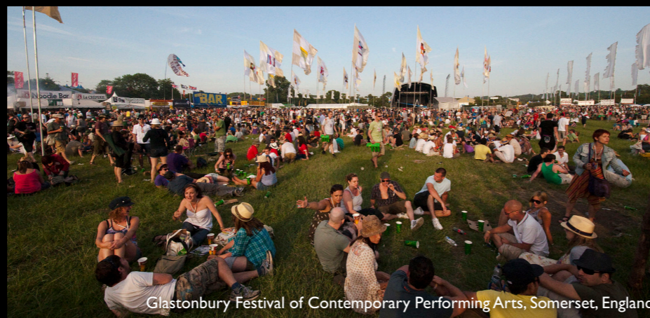
Glastonbury Festival of Contemporary Performing Arts, Somerset, England