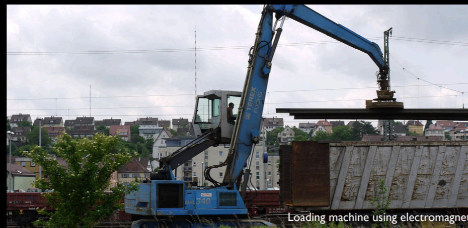
Loading machine using electromagnet