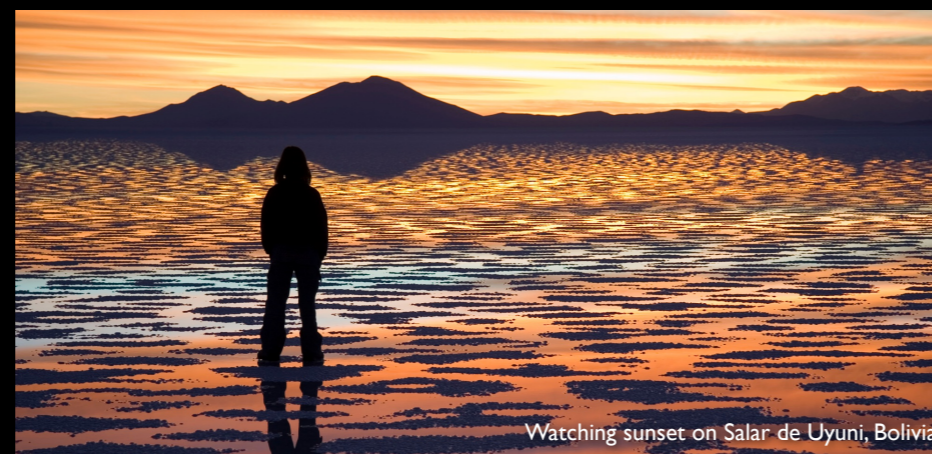
Watching sunset on Salar de Uyuni, Bolivia