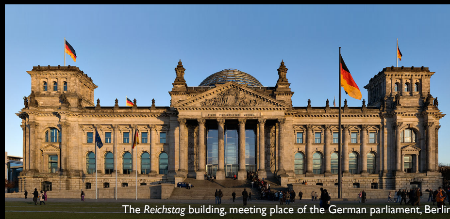
The Reichstag building, meeting place of the German parliament, Berlin