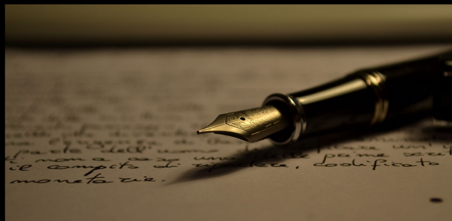
Antonio Litterio / CC BY-SA 3.0