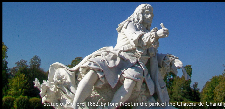
Statue of Molière, 1882, by Tony Noël, in the park of the Château de Chantilly