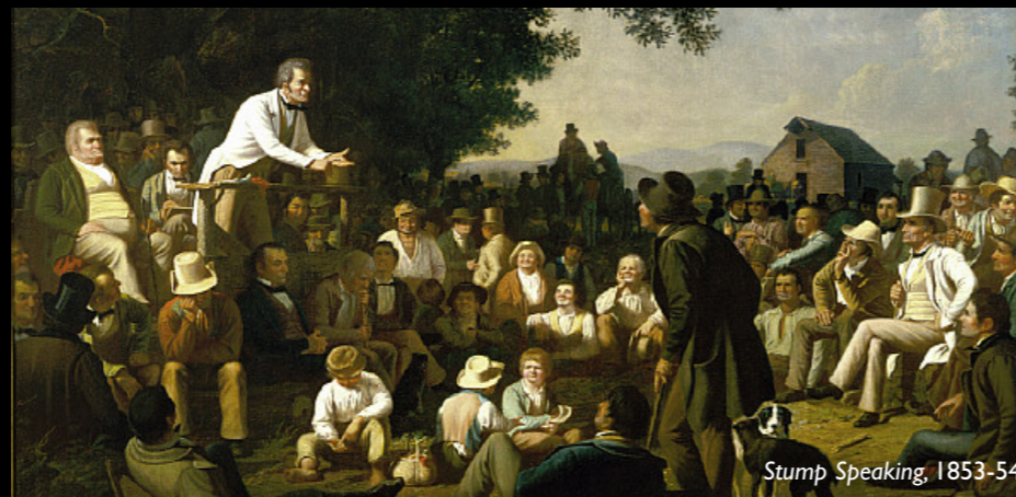
George Caleb Bingham