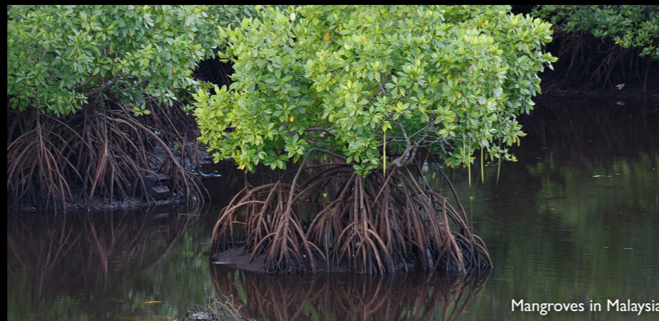
Mangroves in Malaysia