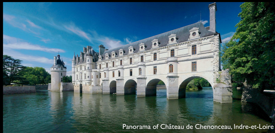
Panorama of Château de Chenonceau, Indre-et-Loire