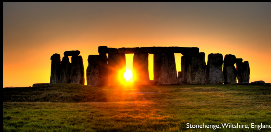
Stonehenge, Wiltshire, England