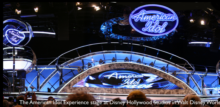
The American Idol Experience stage at Disney Hollywood Studios in Walt Disney World